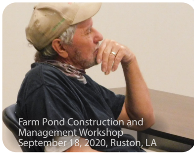
Farm Pond Construction and Management Workshop September 18, 2020, Ruston, LA