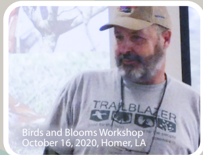
Birds and Blooms Workshop October 16, 2020, Homer, LA

Special recognition and thanks go to Bossier Parish Police Jury, Webster Parish Police Jury, Lincoln Parish Police Jury, Claiborne Parish Police Jury, Union Parish Police Jury, Bienville Parish Police Jury, and Jackson Parish Police Jury for their financial and in-kind contributions to Trailblazer RC&D. These donations were critical in keeping Trailblazer operational in 2020 to offer training opportunities in your communities.