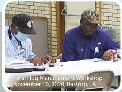
Feral Hog Management Workshop November 10, 2020, Bastrop, LA