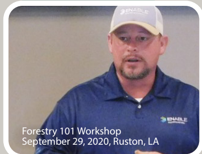
Forestry 101 Workshop September 29, 2020, Ruston, LA