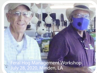
Feral Hog Management Workshop July 28, 2020, Minden, LA