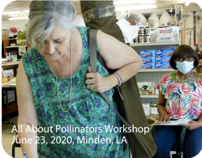
All About Pollinators Workshop June 23, 2020, Minden, LA