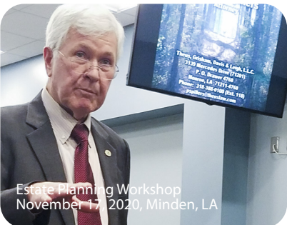
Estate Planning Workshop November 17, 2020, Minden, LA

More people having access to information and opportunities!