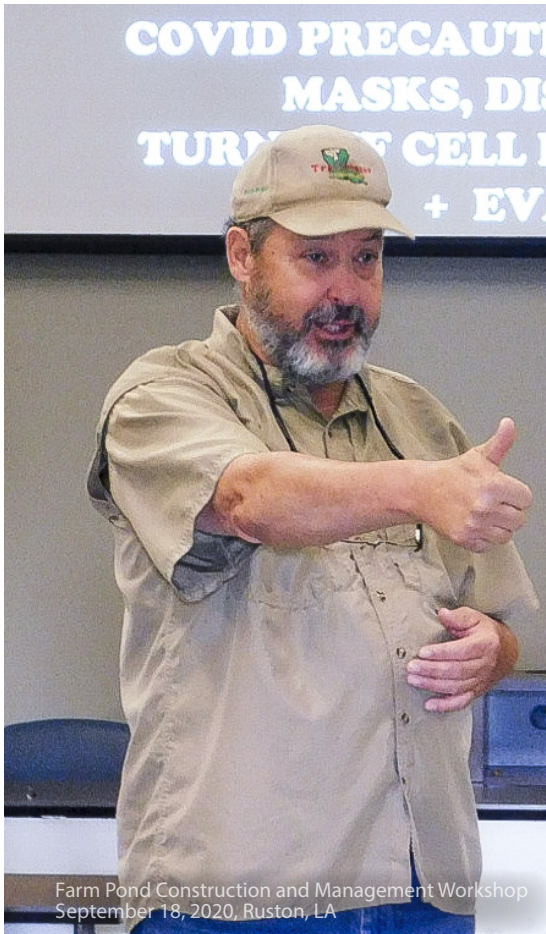
Farm Pond Construction and Management Workshop September 18, 2020, Ruston, LA