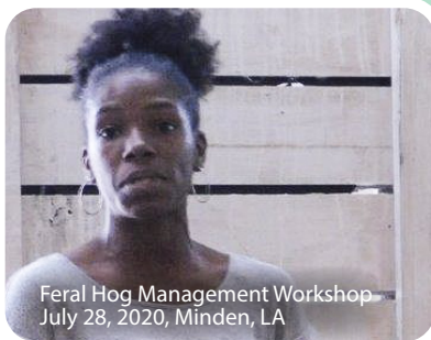
Feral Hog Management Workshop July 28, 2020, Minden, LA