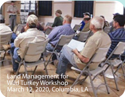
Land Management for Wild Turkey Workshop March 12, 2020, Columbia, LA

People learning how to conserve and protect the natural resources of their land!