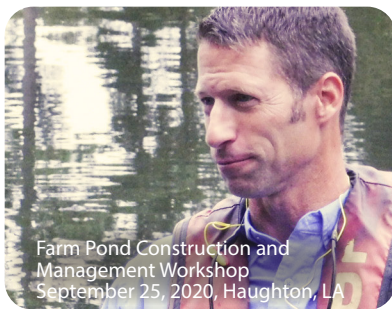
Farm Pond Construction and Management Workshop September 25, 2020, Haughton, LA

Dear Friends, When we began 2020, we were planning new workshops, partnerships, and opportunities. We were expecting an amazing year for Trailblazer. No one could have predicted the disruption and devastation that would be caused by the COVID-19 pandemic.