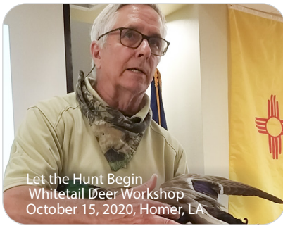
Let the Hunt Begin Whitetail Deer Workshop October 15, 2020, Homer, LA