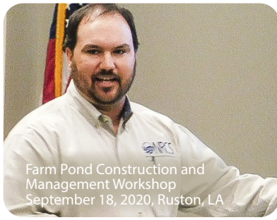
Farm Pond Construction and Management Workshop September 18, 2020, Ruston, LA