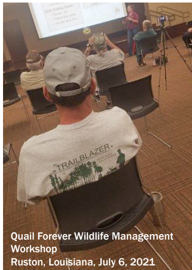
Quail Forever Wildlife Management Workshop Ruston, Louisiana, July 6, 2021