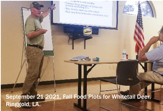
September 21 2021, Fall Food Plots for Whitetail Deer, Ringgold, LA.

Ruston, Haughton, and Ringgold, Louisiana