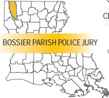
BOSSIER PARISH POLICE JURY