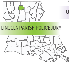
LINCOLN PARISH POLICE JURY