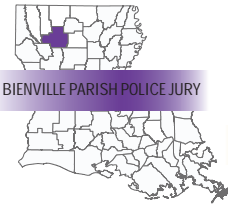
BIENVILLE PARISH POLICE JURY