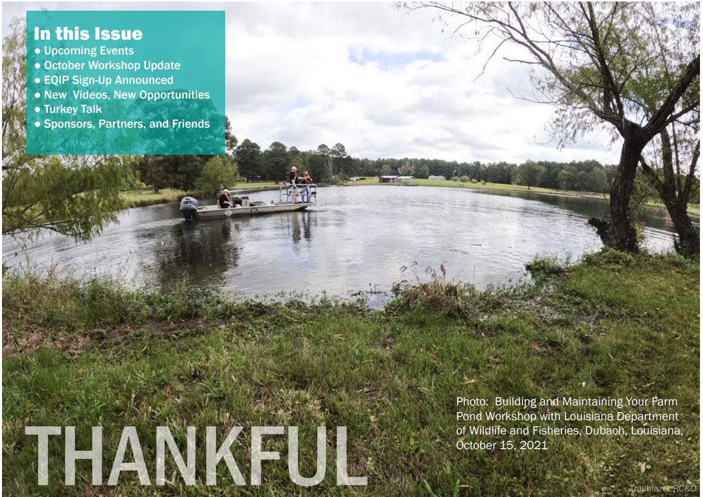
Photo: Building and Maintaining Your Farm Pond Workshop with Louisiana Department of Wildlife and Fisheries, Dubach, Louisiana, October 15, 2021