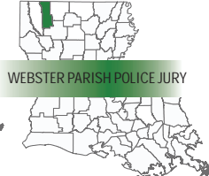
WEBSTER PARISH POLICE JURY