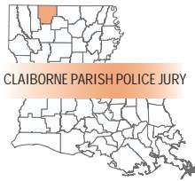
CLAIBORNE PARISH POLICE JURY