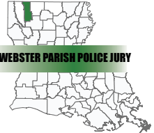
WEBSTER PARISH POLICE JURY