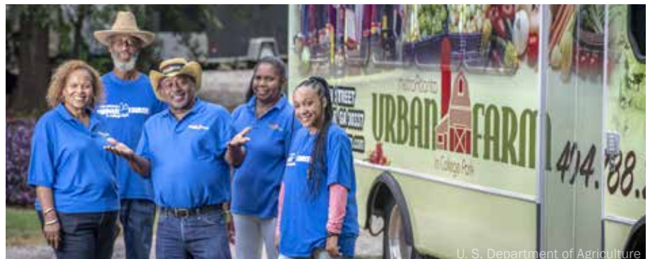
U. S. Department of Agriculture

For more information on USDA NRCS, visit www.nrcs.usda.gov .