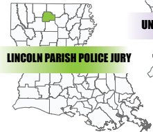
LINCOLN PARISH POLICE JURY