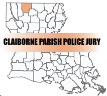
CLAIBORNE PARISH POLICE JURY