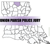
UNION PARISH POLICE JURY