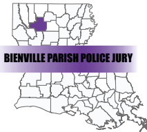
BIENVILLE PARISH POLICE JURY