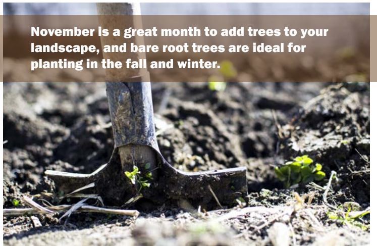
November is a great month to add trees to your landscape, and bare root trees are ideal for planting in the fall and winter.

Bare root trees may be purchased from local nurseries or online. When you receive your tree, it is important to keep the roots moist until planting. If the roots dry out, the tree may suffer poor growth or die. Ideally, a bare root tree should go directly from the packing material to the planting hole. Even a short exposure on a hot day may kill the tree's roots.