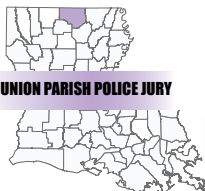
UNION PARISH POLICE JURY