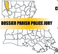
BOSSIER PARISH POLICE JURY