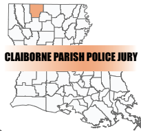
CLAIBORNE PARISH POLICE JURY