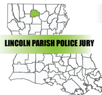
LINCOLN PARISH POLICE JURY