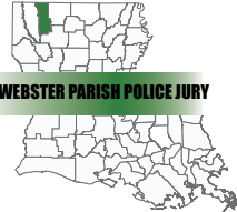
WEBSTER PARISH POLICE JURY