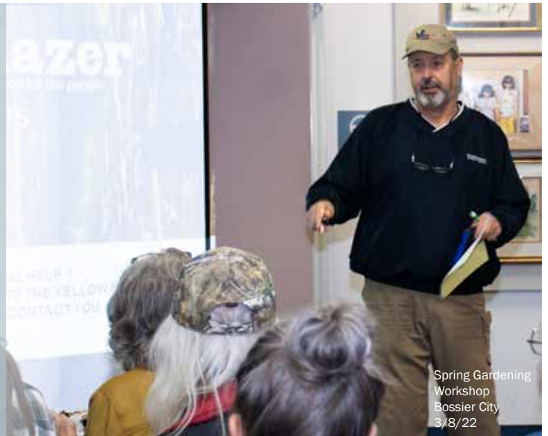
Spring Gardening Workshop Bossier City 3/8/22

Dear Friends, As many of you know, 2023 was a very challenging year for Trailblazer—as it was for many of you. Funding issues led to workshop cancellations and a reevaluation of resources available. However, by the grace of God and with the great support of our fantastic board of directors and loyal sponsors, Trailblazer was able to move forward and continue to offer quality