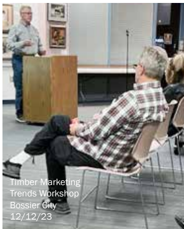
Timber Marketing Trends Workshop Bossier City 12/12/23

Because of this support, Trailblazer continues to provide leadership, coordination, and partnership to help landowners and managers, communities, and individuals conserve, manage, and protect the natural resources of the land.