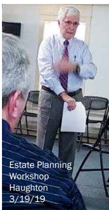
Estate Planning Workshop Haughton 3/19/19