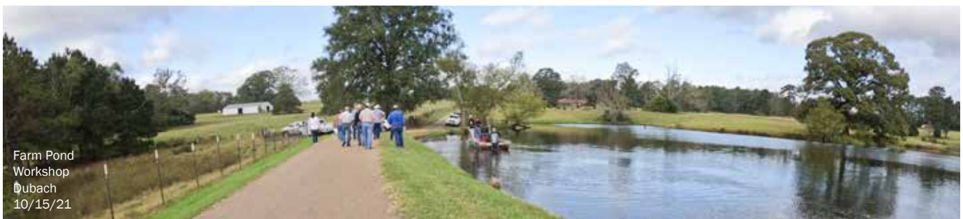
Farm Pond Workshop Dubach 10/15/21